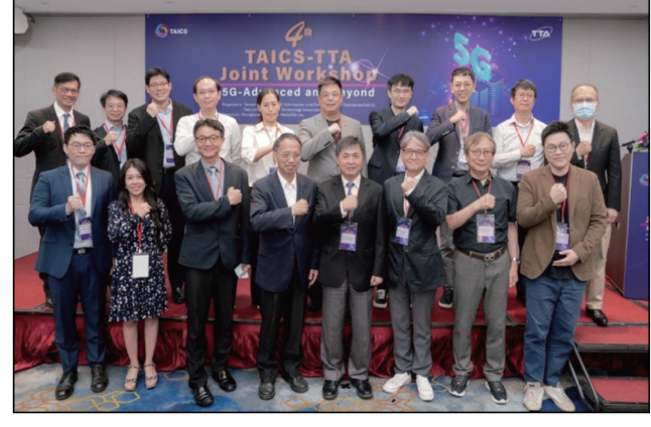
Caption: group photo